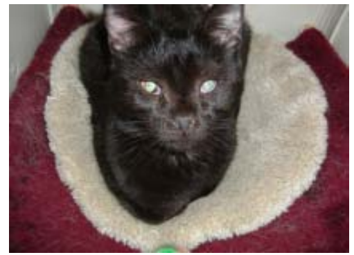
Della, 2007 Top Cat

It is better to adopt an adult cat if you are looking to have just one kitty that will be home alone during the day. Kittens often prefer lots of attention and want to play so if they don’t have a playmate they will try to create one out of objects in the house. Adult cats are usually content being by