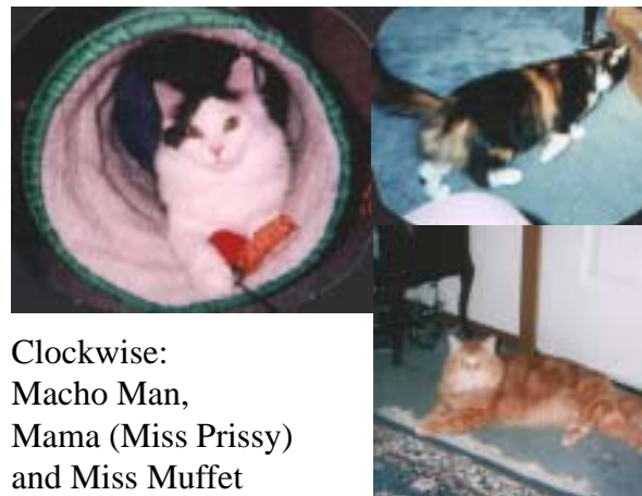
Clockwise: Macho Man, Mama (Miss Prissy) and Miss Muffet