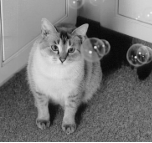
Sweetpea was adopted by a CWA supporter in November 2004.