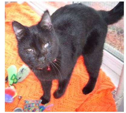
Della, 2008 Top Cat

It makes me happy to announce the success of our annual Cat Caper 5K run. We had an amazing turnout and it was very fun! My buddy Rusty (I told you all about him in our Summer issue) was fortunate enough to go to the event and see it all unfold. Check out the fun picture of him on the front page. I think he's very handsome! By the way, he and Scarlett (see photo to the right) says thank you for all the head pats and chin scratches!